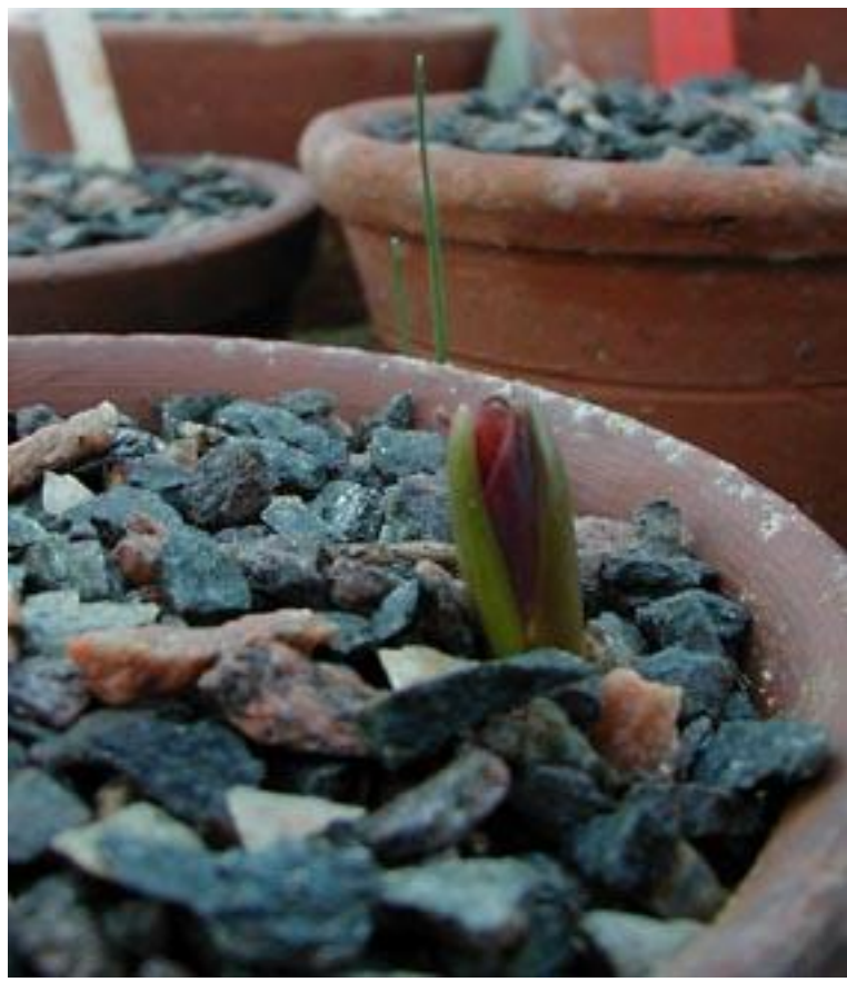
Fritillaria causasica 1

The next early fritillaria to show is F. caucasica. We have several forms and it is interesting to compare how they emerge.