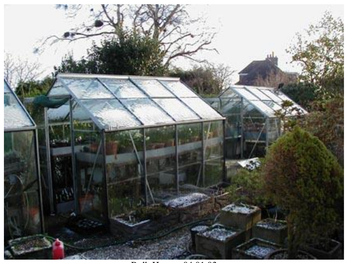
Bulb Houses 04.01.03

Having watered the bulb houses the weather was sure to turn cold and it has.